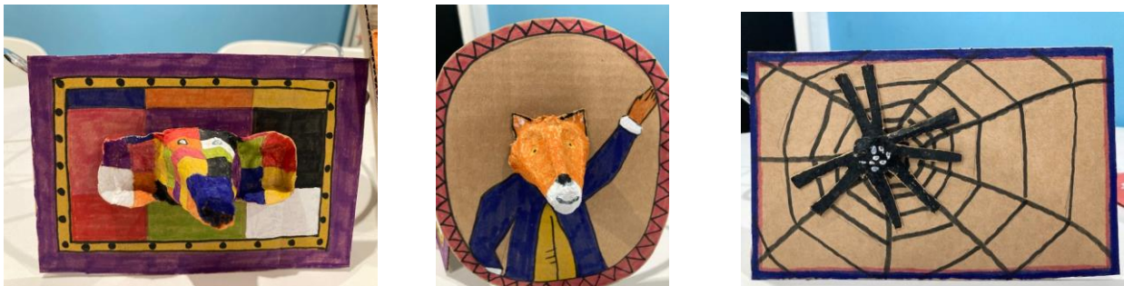
L-R: Elmer the Elephant, Fantastic Mr Fox and Charlotte from Charlotte's Web

6) Finally decorate your character's head or object and glue this onto your frame.